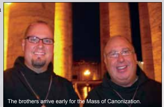
The brothers arrive early for the Mass of Canonization.

For your own growth and faith formation, check into the life of Saint Damien of Moloka'i, one of the newest saints of the Church! Saint Damien, Pray for us!