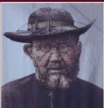
A New Saint for the Church... Damien of Moloka'i