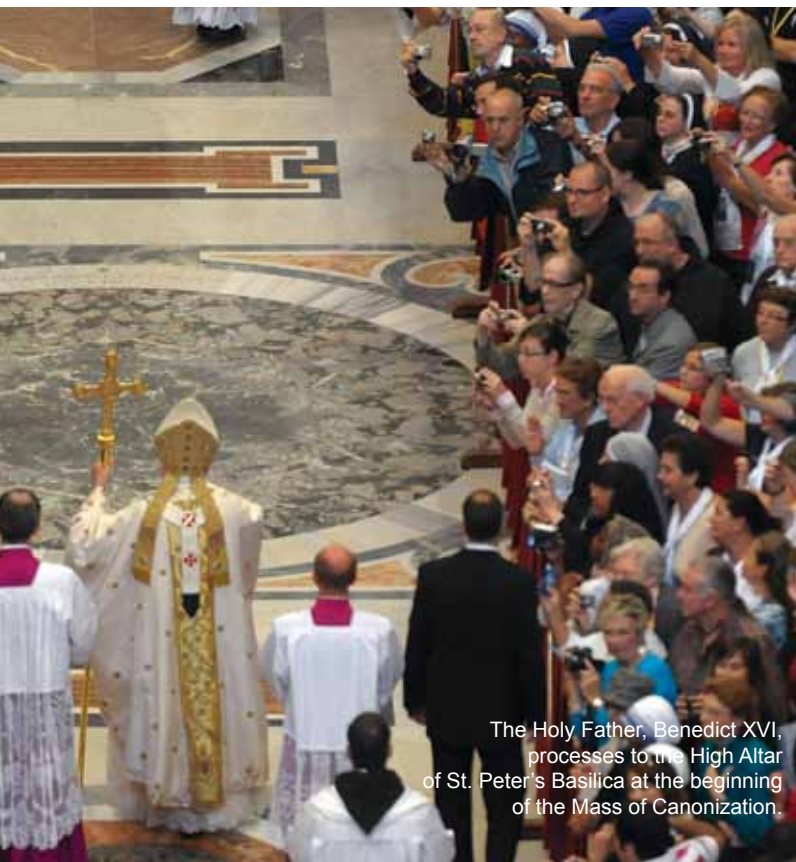
The Holy Father, Benedict XVI, processes to the High Altar of St. Peter's Basilica at the beginning of the Mass of Canonization.