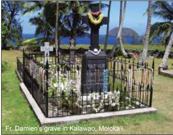
Fr. Damien's grave in Kalawao, Moloka'i.

ence as servants, beyond that of our generos- ity.”