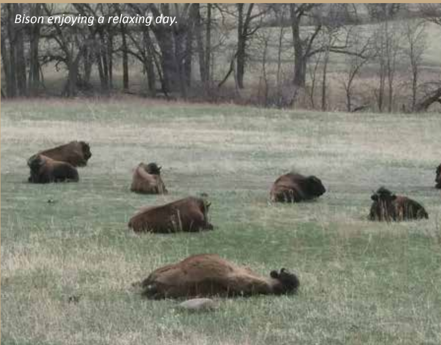
Bison enjoying a relaxing day.

We slept well at a local hotel that night, because we had the final venture of driving ten hours home the next day. The drive allowed us the perspective to reflect how, via your generosity, God continues to broaden the mission of the Franciscan Brothers of Peace in providing for the needs of the community of believers. Thank you for your trust in us!