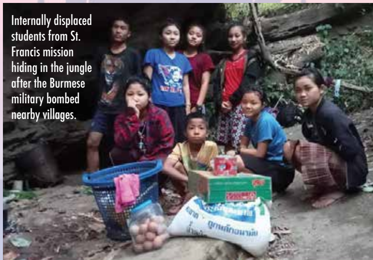
Internally displaced students from St. Francis mission hiding in the jungle after the Burmese military bombed nearby villages.