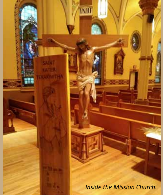
Inside the Mission Church.