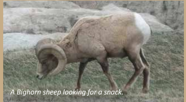
A Bighorn sheep looking for a snack.