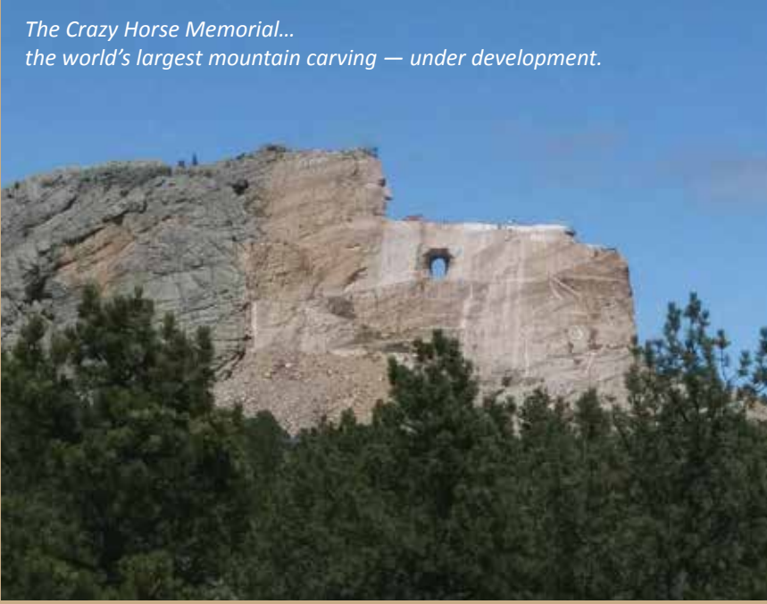
The Crazy Horse Memorial... the world's largest mountain carving — under development.