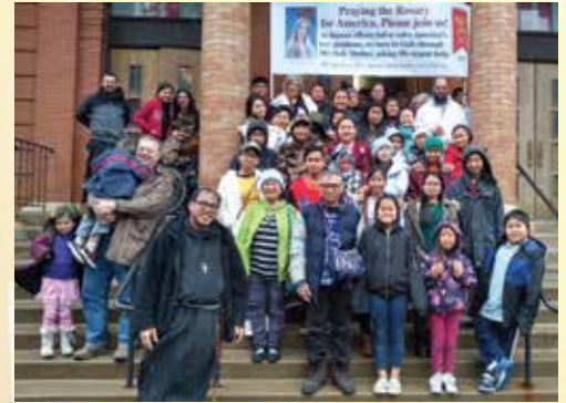
loons to represent the prayers of the rosary.