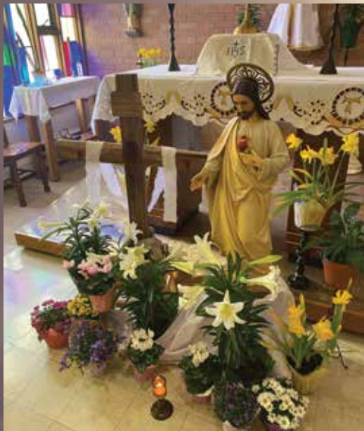
The Brothers celebrated the Feast of feasts at both Queen of Peace Friary (above) and Blessed Solanus Casey Friary (left & right).