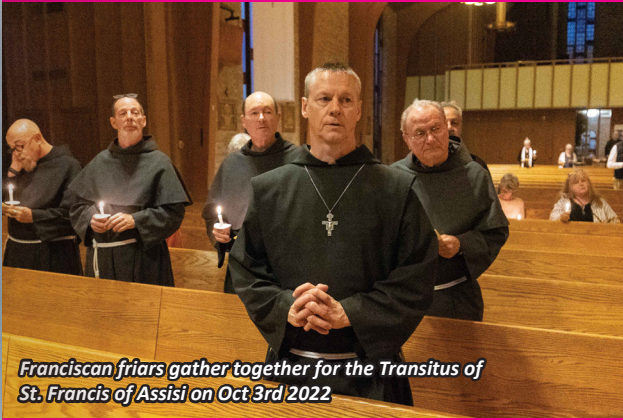
Franciscan friars gather together for the Transitus of St. Francis of Assisi on Oct 3rd 2022