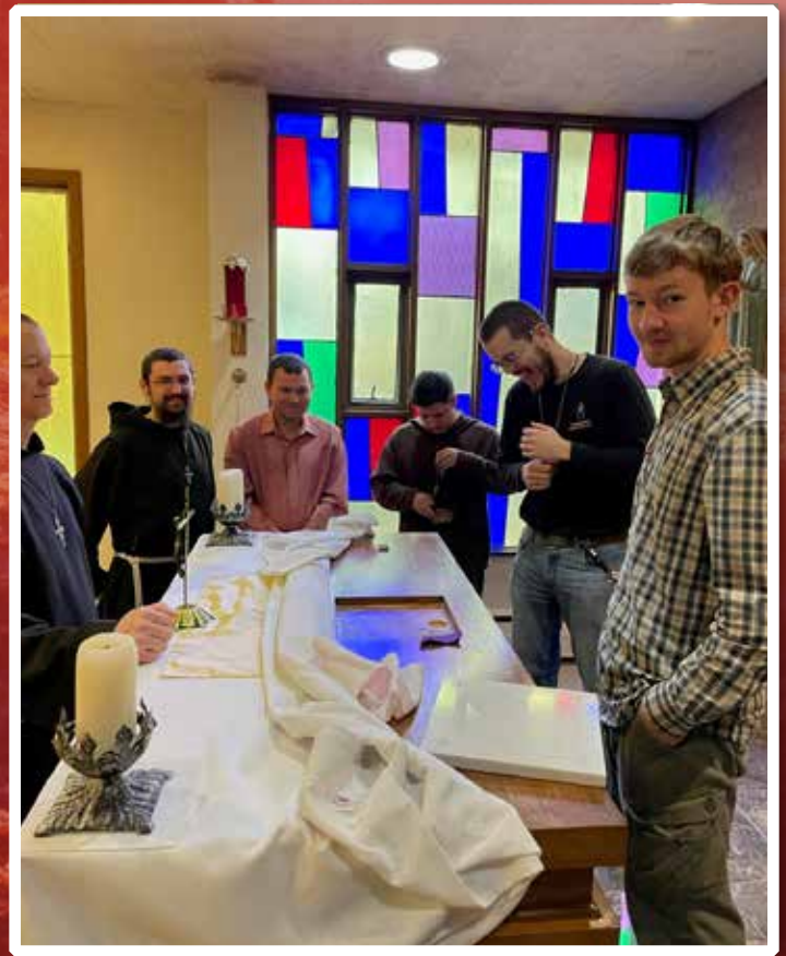
Vocation visitors venerating the relic of Blessed Solanus Casey during a come and see weekend. Thank you for praying for vocations.