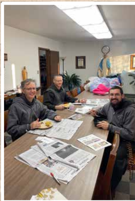
The Brothers have breakfast before the start of our Thanksgiving food distribution. Thank you to all the people who donated food and monetary donations. Also, thank you to the various organizations that donated the new winter coats in the background. It was a welcomed gift for many on a cold day.