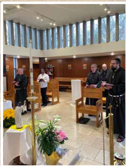
Easter morning 2024, The Brothers can finally say, ALLELUIA!