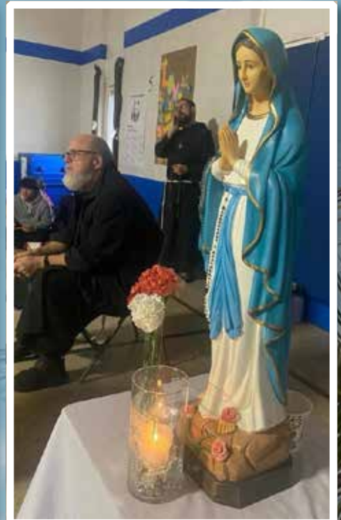
Brothers join St. Jerome School in Maplewood in praying the living Rosary