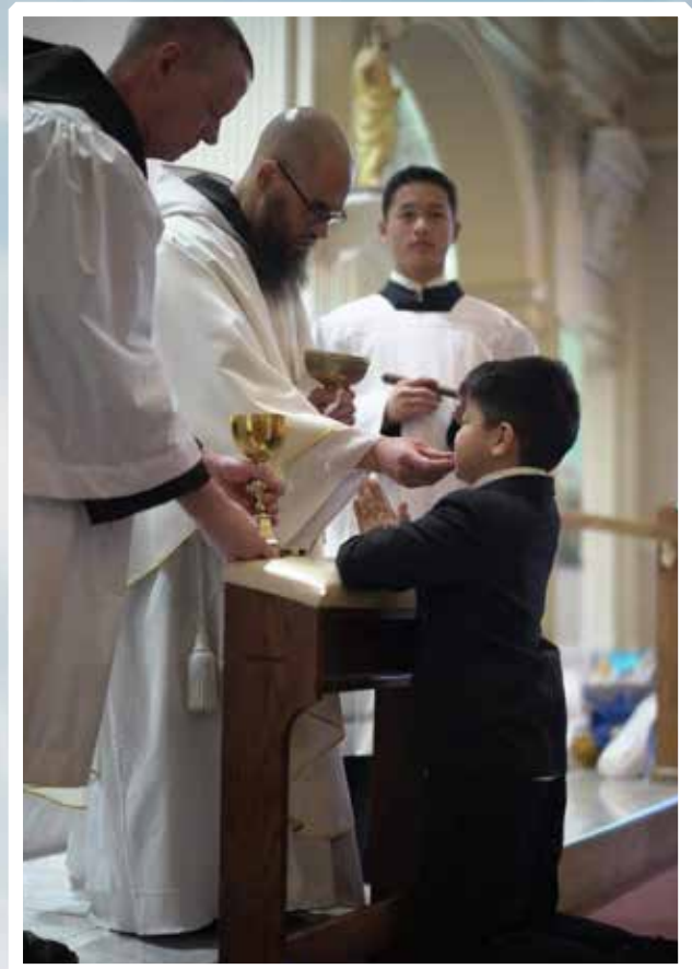
On Easter Sunday 2024, sixteen youth from the Karen Community at St. Casimir Church and St. Jerome's school received their First Holy Communion.