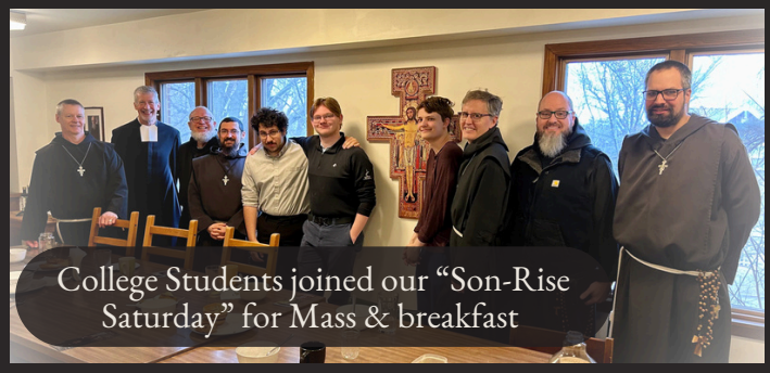
College Students joined our "Son-Rise Saturday" for Mass & breakfast