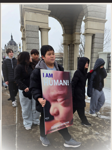
St Jerome School 8 th Graders on their first March for Life!