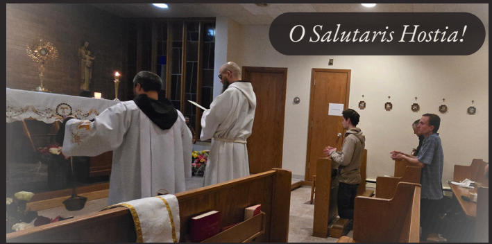
O Salutaris Hostia!