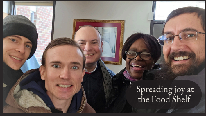
Spreading joy at the Food Shelf