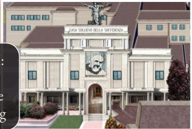
Plans in Lansing, MI: for a new Padre Pio Med School & Home for Relief of Suffering

JESUS IS THE LIFE Jesus is the life that I want to live. He is the light that I want to radiate. He is the way to the Father. He is the love with which I want to love. He is the Joy that I want to share. He is the peace that I want to sow. Jesus is everything to me. Without Him I can do nothing.