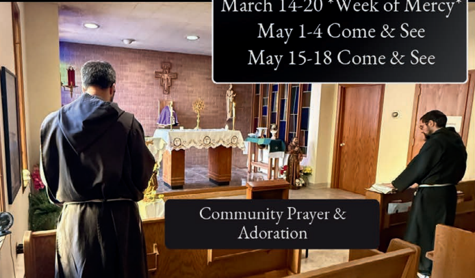
Community Prayer & Adoration