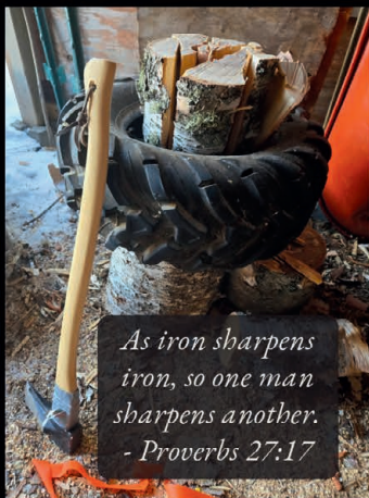
Community Retreat to the Boundary Waters

As iron sharpens iron, so one man sharpens another. - Proverbs 27:17